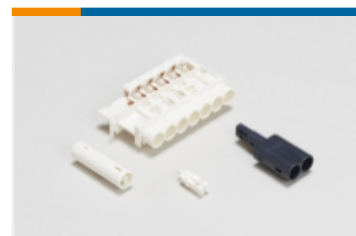
Plug & Socket Lighting Connectors(54)