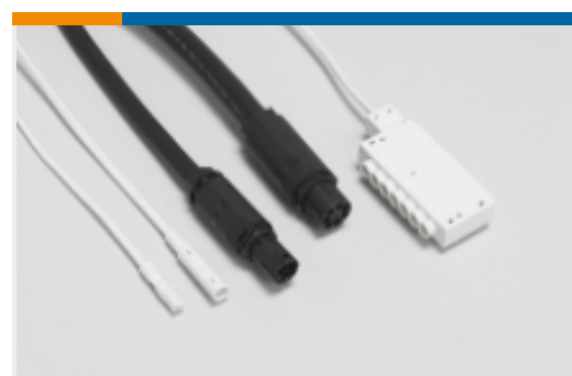
Lighting Cable Assemblies(1)